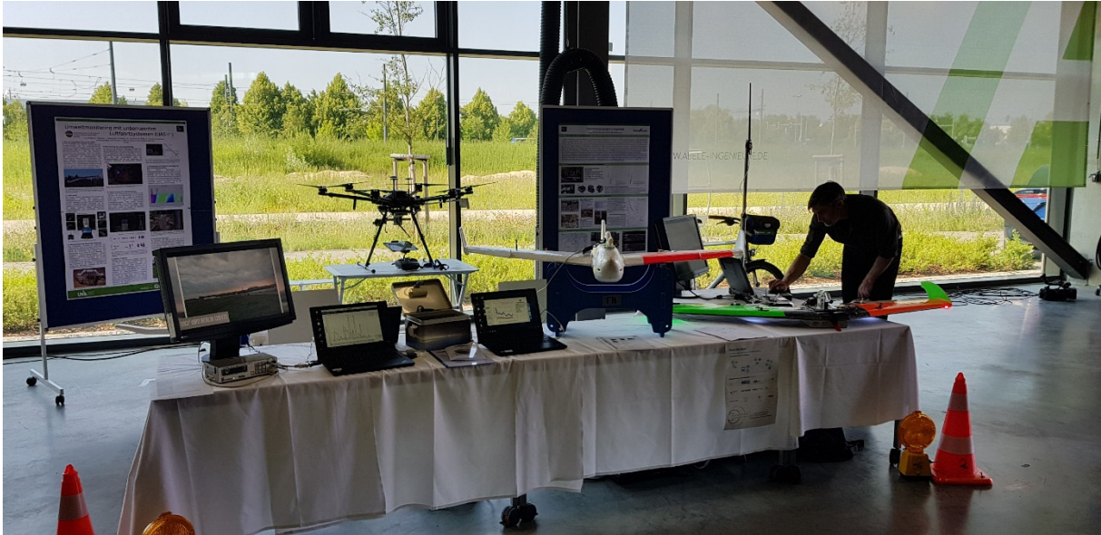
Figure 1: The exhibition stand of the University of Augsburg at the Clean Air Tech Day